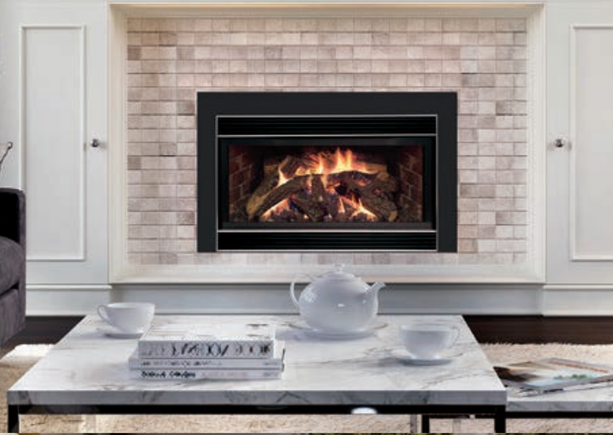
D40 with Premium Fiber Oak Log Set, Antique Red Firebrick Liner, and Contemporary Silver Millennia Front