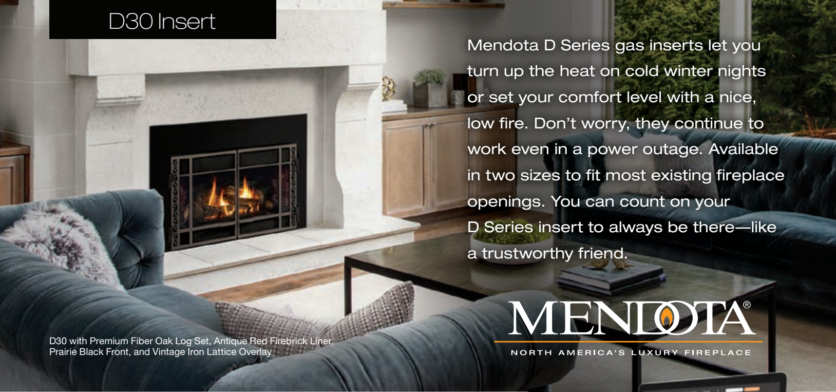
D30 with Premium Fiber Oak Log Set, Antique Red Firebrick Liner, Prairie Black Front, and Vintage Iron Lattice Overlay

Mendota D Series gas inserts let you turn up the heat on cold winter nights or set your comfort level with a nice, low fire. Don't worry, they continue to work even in a power outage. Available in two sizes to fit most existing fireplace openings. You can count on your D Series insert to always be there—like a trustworthy friend.